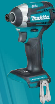
DTD154Z 18V Brushless 3-Stage Impact Driver