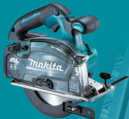
DCS553Z 18V Brushless 150mm (5-7/8") Metal Cutter