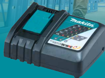
DC18RC Single Port Rapid Charger