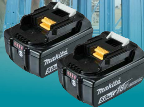
BL1850B x 2 18V 5.0Ah Battery with fuel gauge indicator