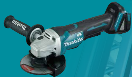
DGA508Z 18V Brushless 125mm Paddle Switch Angle Grinder