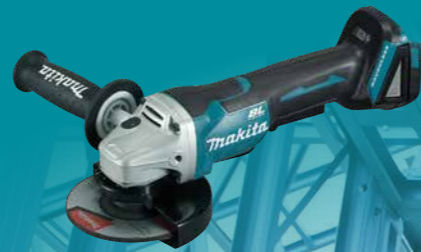
DGA508Z 18V Brushless 125mm Paddle Switch Angle Grinder