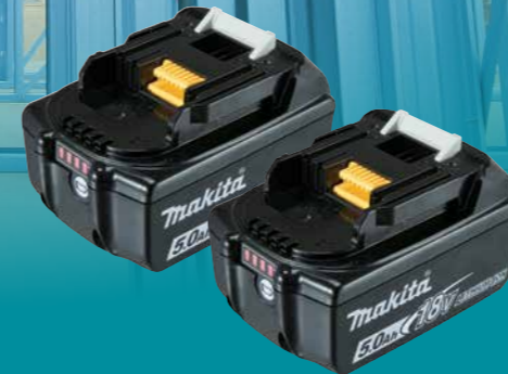
BL1850B x 2 18V 5.0Ah Battery with fuel gauge indicator