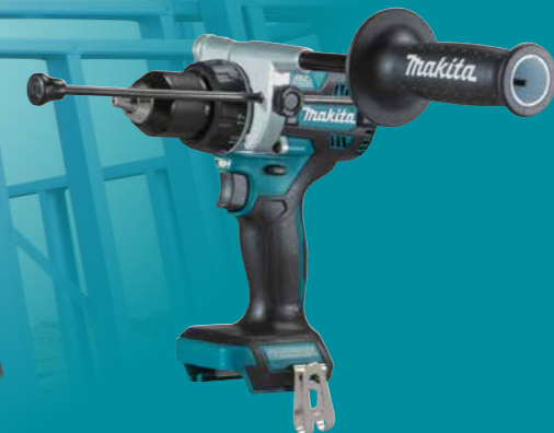
DHP486Z 18V Brushless Heavy Duty Hammer Driver Drill