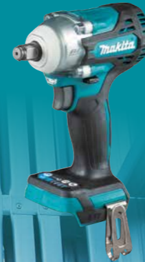
DTW300Z 18V Brushless 1/2" Impact Wrench