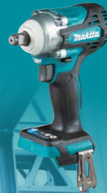
DTW300Z 18V Brushless 1/2" Impact Wrench