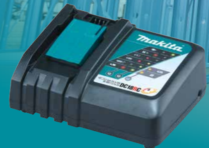
DC18RC Single Port Rapid Charger