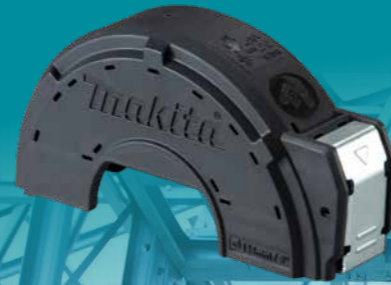
199710-5 125mm Clip On Cutting Wheel Guard