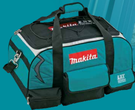
199936-9 LXT Tool Carry Bag